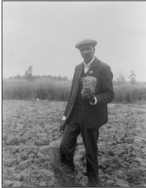
"George Washington Carver, full-length portrait, standing in field, probably at Tuskegee, holding a piece of soil." 1906