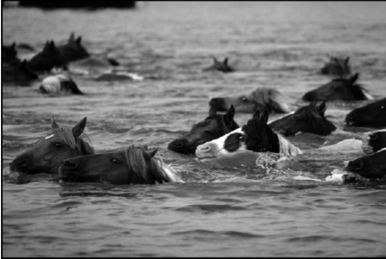
Photograph of wild Chincoteague ponies swimming the Assateague Channel (# ngs12_0248)

6 The cowboys waited a bit for the tide to change. Meanwhile, I imagined myself flying through the wind on a black-and-white mare. Oh, how I wished I could have a horse like that! Then, all of a sudden, I heard a shout from the crowd on the Chincoteague shore. I nearly jumped overboard with excitement! The ponies were stepping into the channel.