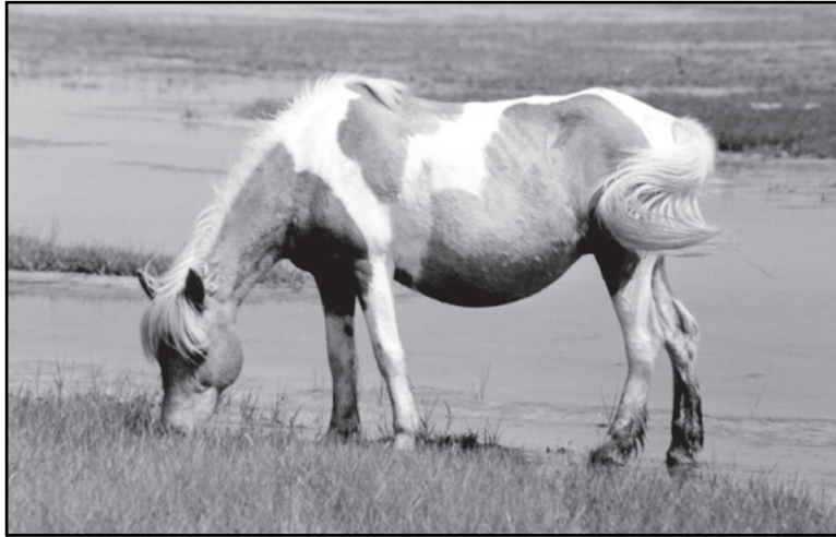
Text and photographs from "The Wild Horses of Assateague Island," National Park Service, US Department of the Interior