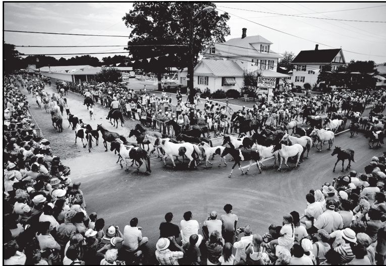
Photograph of ponies walking through town (NGS Image No. 719970), copyright © by Medford Taylor/ National Geographic Stock. Used by permission.